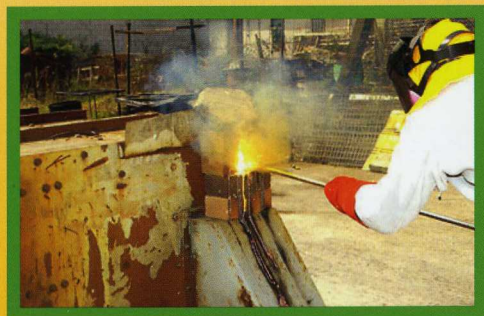
Man in appropriate safety gear using oxygen lance pipe.