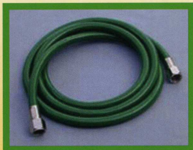
3/8" Oxygen Hose with fittings

Lance pipe holders can be adjusted to fit multiple pipe diameters by changing the size of grommet that is used.